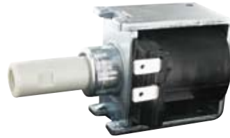
MODEL ET508 SERIES (FNPT)