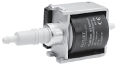
MODEL ET508 SERIES (HB)

ITT Flojet oscillating pumps are designed for general consumer, commercial and industrial applications. All models are self-priming double insulated and built to draw low amps for cool operation and can run dry for extended periods of time without damage.